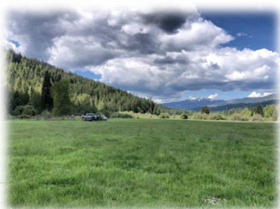
Left, a wonderful day to enjoy beautiful nature around Brickel Creek. Right, a pickup load of plants ready for setting.