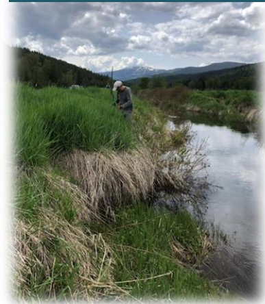
A volunteer sets plantings along the bank of Brickel Creek